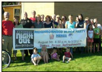
National Night Out in the Community