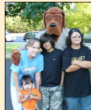
Kids and McGruff the Crime Dog enjoying the National Night Out Against Crime event.

The mission of Spokane Community Oriented Policing Services (C.O.P.S.) is to help promote and support an environment for a safe community. In partnership with the City of Spokane and its residents, Washington State Department of Corrections, and community stakeholders, we provide services to neighborhoods that increase volunteer efforts and improve the quality of life in the entire community.