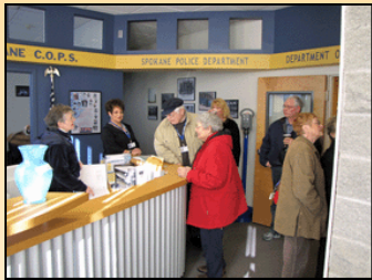
Front Desk Operations