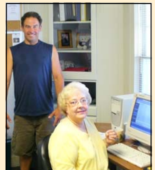
Logan volunteers taking care of business at C.O.P.S. shop.