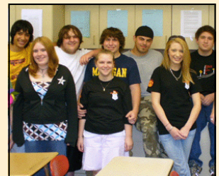
Lewis & Clark C.O.P.S. interns.