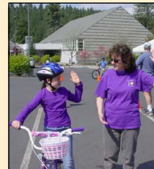
Volunteers hold a Bike Rodeo/Helmet fitting event.