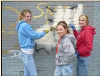
Paint Over Graffiti