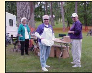
Volunteers attend the Spokane RiverFest bicycle area.