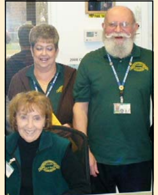
Northwest volunteers from the Shadle area.

Since the establishment of the first shop, 12 neighborhoods have opened their own C.O.P.S. substations. In each neighborhood where a C.O.P.S. substation is operating, it becomes a focal point for citizen and business involvement.