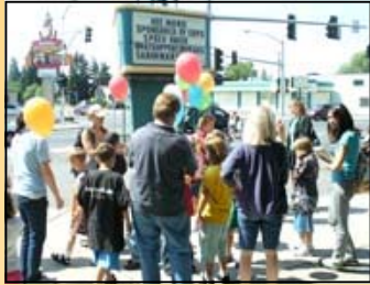
Garland Theatre Movie Week